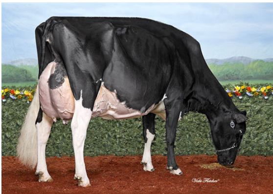
COMESTAR LAMADONA DOORMAN FOURTH DAM