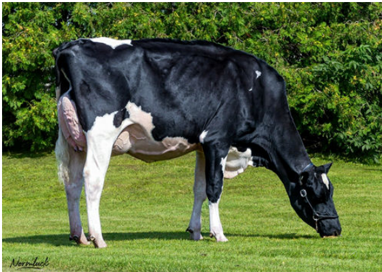
COMESTAR LATINET PERFECT DAM