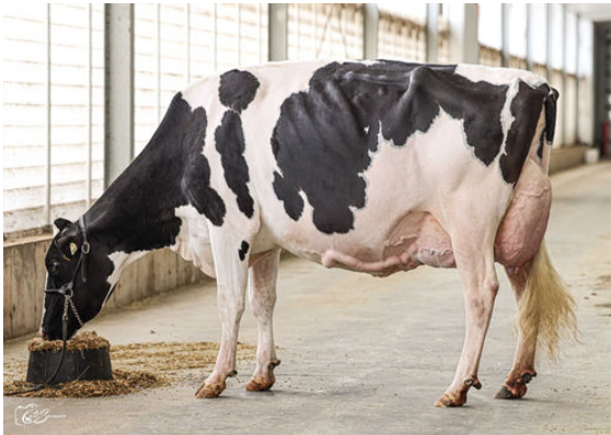
COMESTAR LATASHA TROPIC GRANDDAM