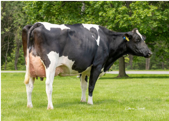
AURORA PERFECT 23719