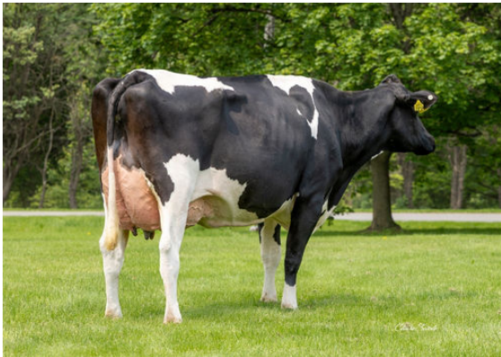
AURORA PERFECT 23719