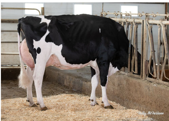
DULET D-LAMBDA KATRINA GRANDDAM