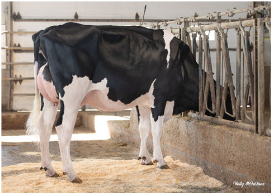
PROGENESIS RANGER KAYLYNN DAM