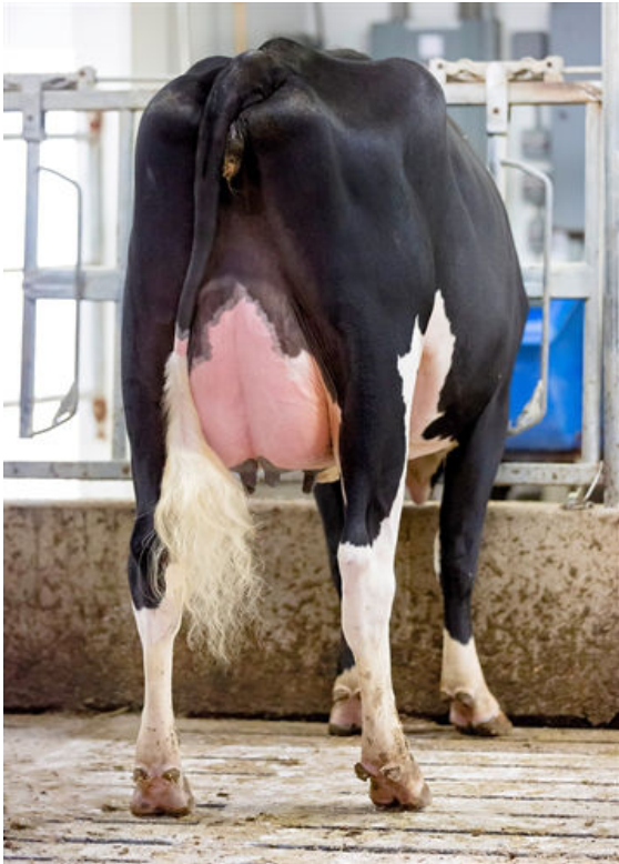
SIEMERS GD PARIS 36374