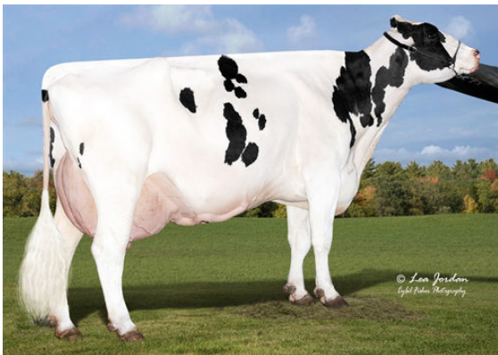
AURORA DOORSOPEN 17054 FOURTH DAM