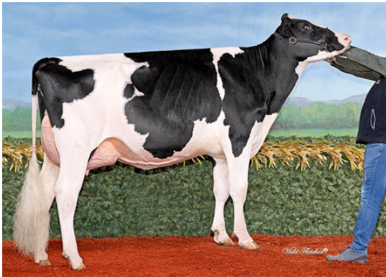
DREWHOLME LAMBDA LEYSURE P GRANDDAM