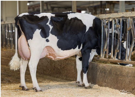
DREWHOLME CONWAY LEYSURE DAM