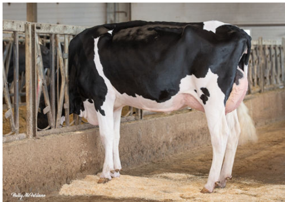
PROGENESIS RANGER LAYLA DAM