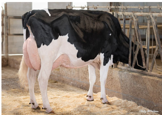
PROGENESIS HIGHJUMP LEADER GRANDDAM