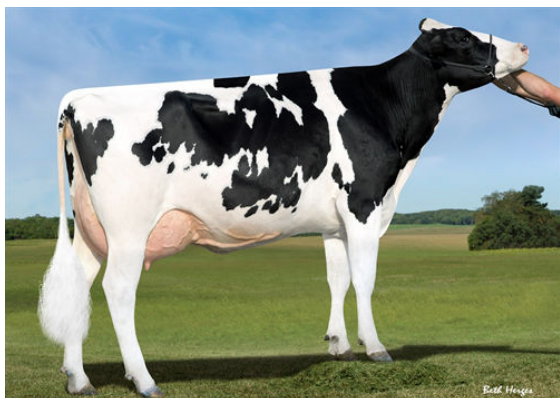
SANDY-VALLEY MORGAN ERA FIFTH DAM