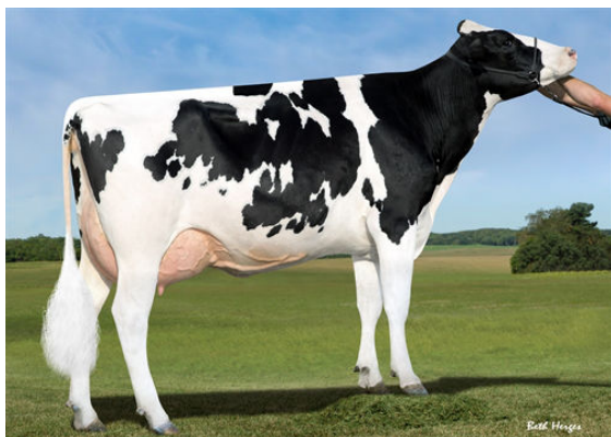
SANDY-VALLEY MORGAN ERA FOURTH DAM