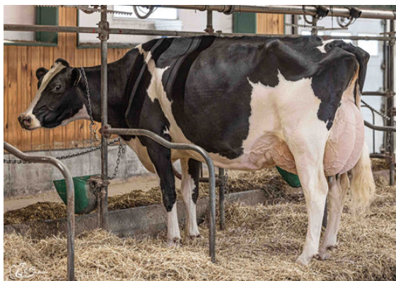
JACOBS LAMBDA BRIAR DAM