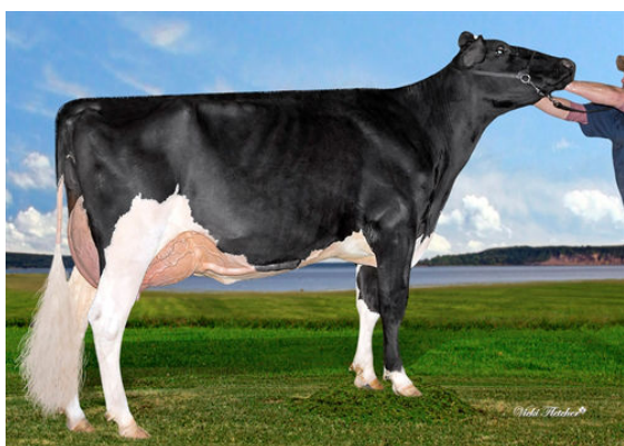
JACOBS UNIX BRILLANT GRANDDAM