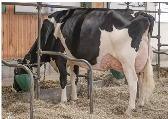
JACOBS LAMBDA BRIAR DAM