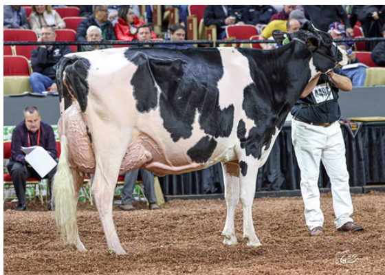
LADYROSE CAUGHT YOUR EYE GRANDDAM