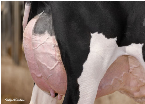
SHELAND PERFECT DAYBREAK GRANDDAM