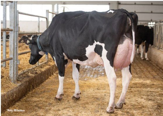
SHELAND PERFECT DAYBREAK GRANDDAM