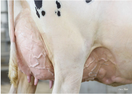
AOT DELUXE HI-LIGHTED GRANDDAM