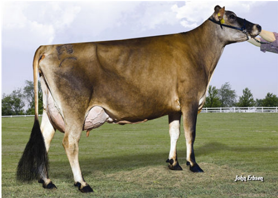
JX FARIA BROTHERS TARGET RONALDO {2} GRANDDAM