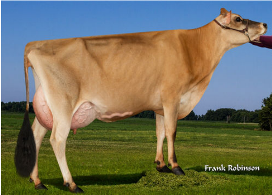
JX SCHULTZ VANDRELL DEXXIE {3}