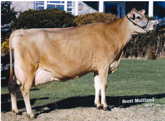
NORVAL ACRES LAD DARLENE THIRD DAM