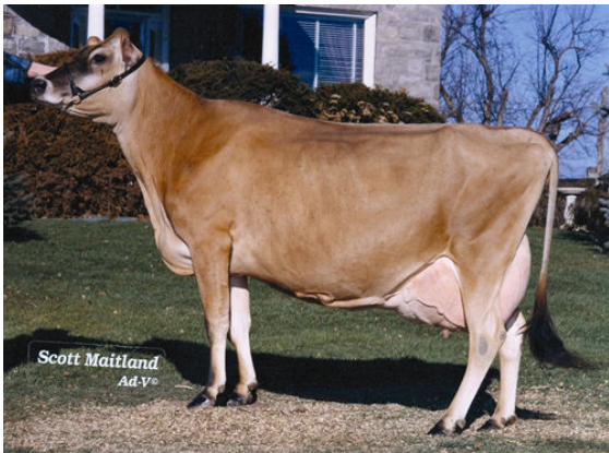
BILLINGS BERRETTA DOROTHY FOURTH DAM