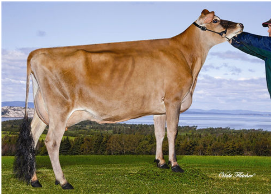
VERJATIN RANDOM LIZ FOURTH DAM