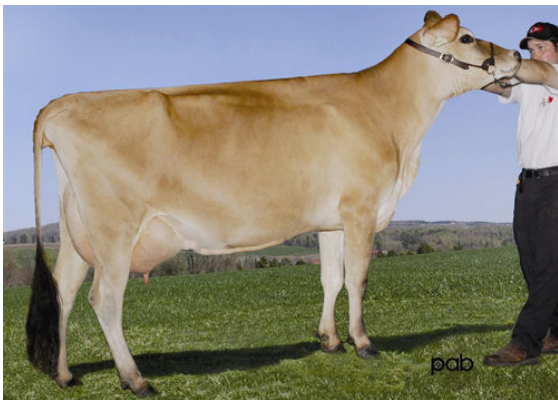
SUNSET CANYON MILITIA LIZA FIFTH DAM