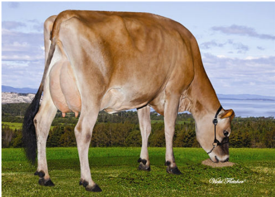
VERJATIN RANDOM LIZ FOURTH DAM