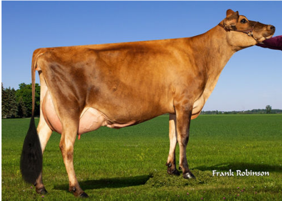
JX VIERRA GYSPY {4} DAM