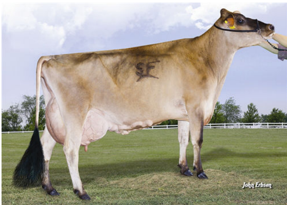
JX FARIA BROTHERS ACTION DEAN SMITH {1} FOURTH DAM