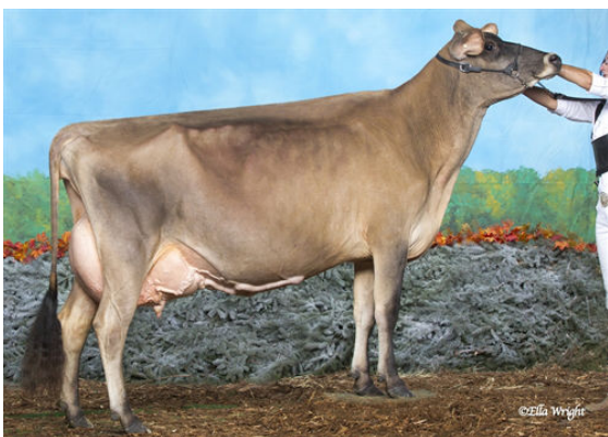
RJF UNIQUE GOVERNOR MERCEDES THIRD DAM