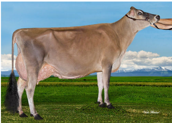
REDHOT MATT TESLA GRANDDAM