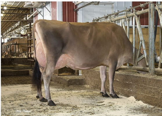
REDHOT MATT TESLA GRANDDAM