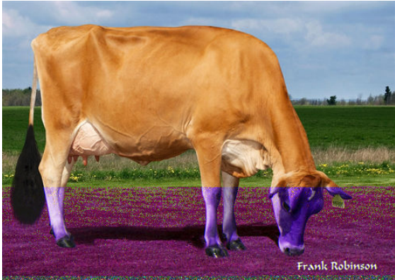
JX VIERRA PRESLEY {6} THIRD DAM