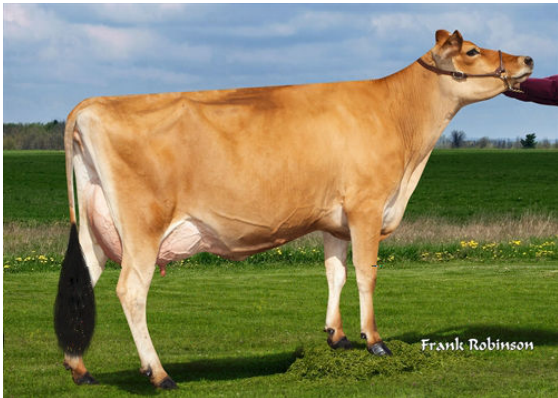
JX VIERRA PRESLEY {6} THIRD DAM