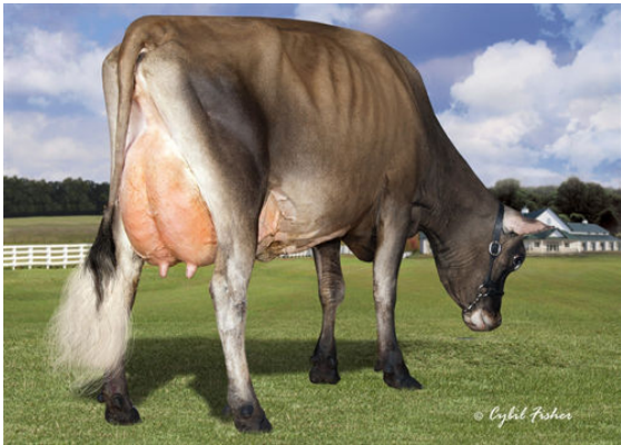
JX MULTI-ROSE OLIVER RUTH {4}- DAM