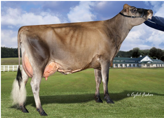
JX MULTI-ROSE OLIVER RUTH {4}- DAM