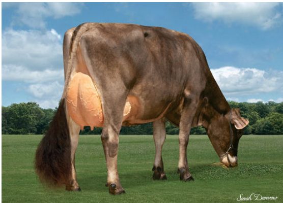
HILLTOP ACRES DB TABBY ETV GRANDDAM