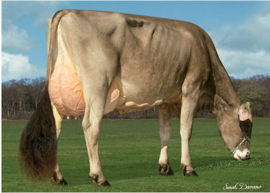
HILLTOP ACRES PAC TAEYN ETV DAM