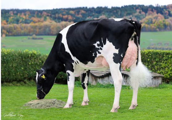
TGD-HOLSTEIN 2020 ASYBA DAM