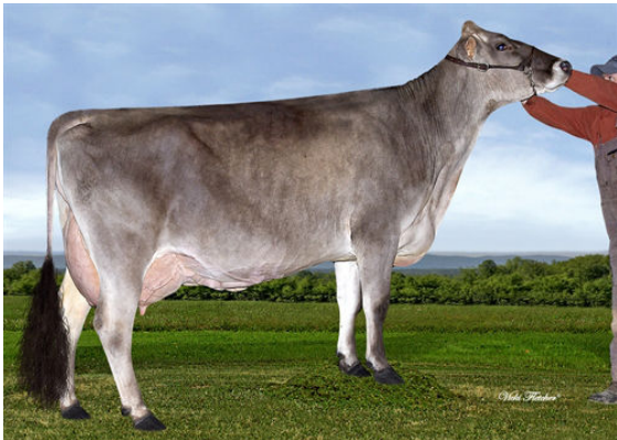
SHADY LANE SWISS BRKNGS ALPHA DAM