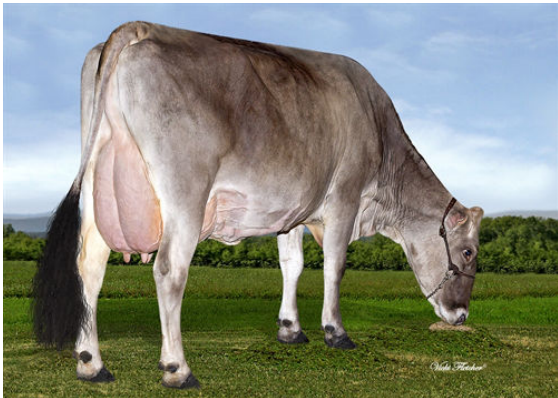
SHADY LANE SWISS BRKNGS ALPHA DAM