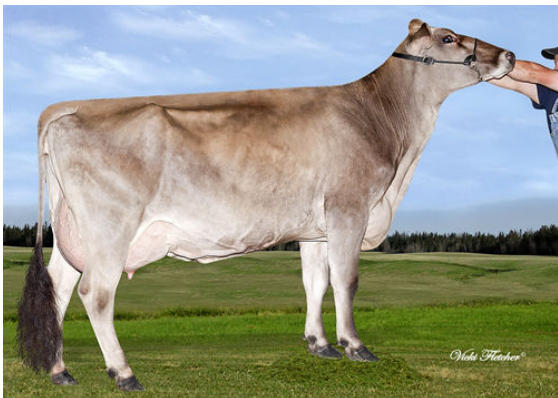
SHADY LANE SWISS SUP ALLRIGHT GRANDDAM