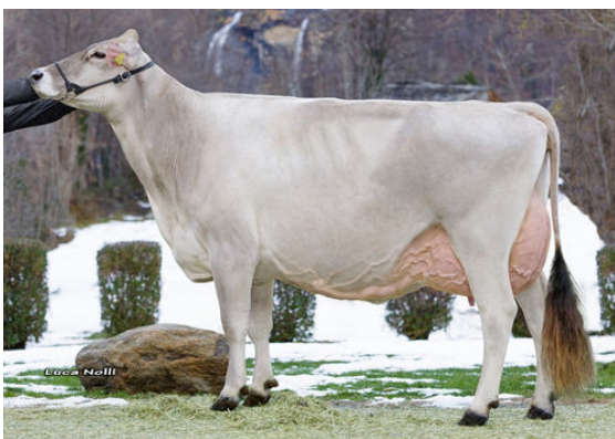
ADRIAN'S CALVIN ELANA DAM