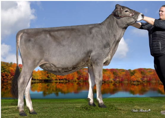
JOLLY ELISIUM MAZIE DAUGHTER