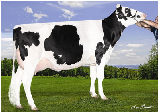
DU PETIT CANTON AFTERRH MARTINE