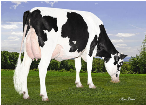
DU PETIT CANTON AFTERRH MARTINE