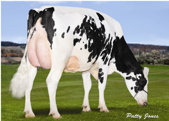
STANTONS AFTER MILKSHAKE