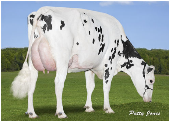
SUMMITHOLM SYMPATICO TORNADO