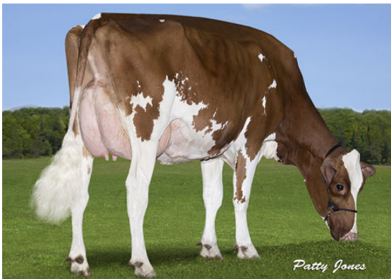
GREENVIEW SYMPATICO JOLENE