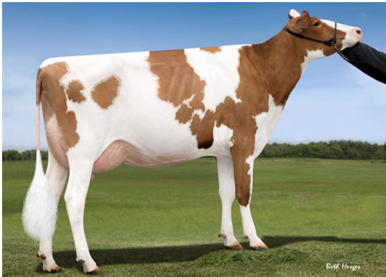
SNOWBIZ SYMPATICO SOFIA-RED