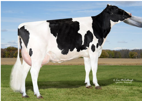
HILLTOP-LLC JESUALDO 6060