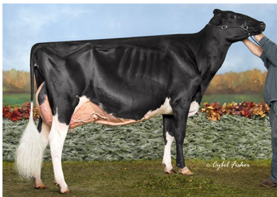
COMESTAR LAMADONA DOORMAN