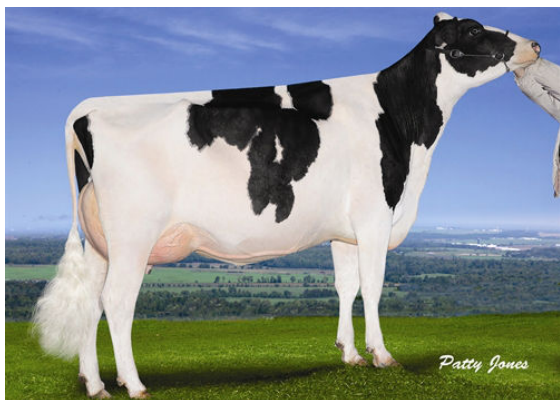
COMESTAR LAUTAMISHA SNOWMAN