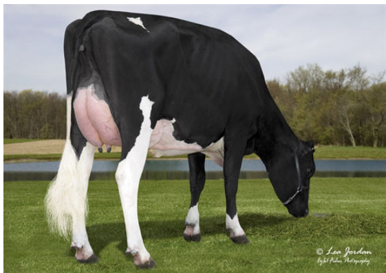
JO-LINE SOCIETY FRANTIC