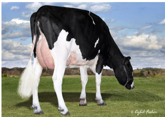
SCHREIBERDALE SOCIETY 3630