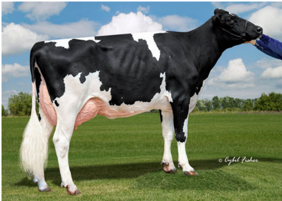
AOT MARK HIGHSTRUNG DAUGHTER