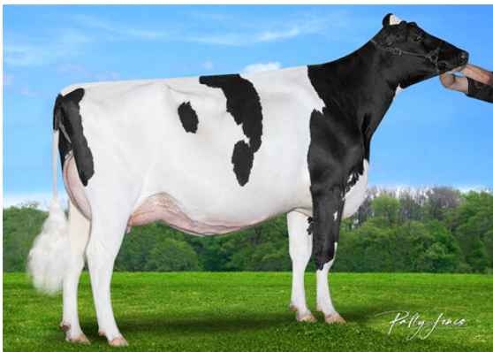
CLAYNOOK ZESTY MARK DAUGHTER