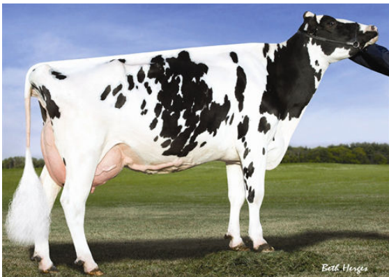
REGANCREST M BENISHA FIFTH DAM