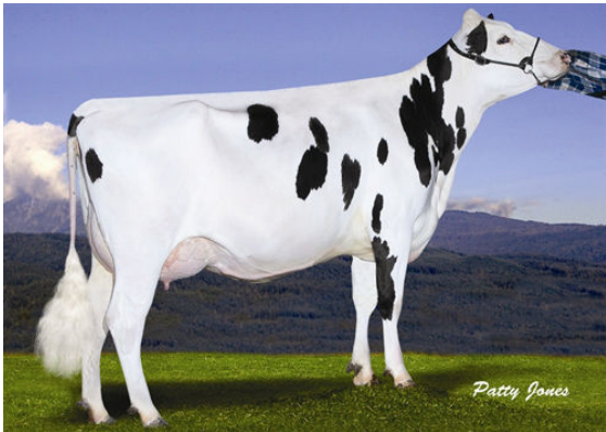
GILLETTE GARRETT LOOKAS FIFTH DAM