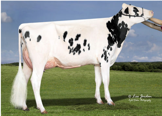
EVANS-H BYWAY JAMISEN