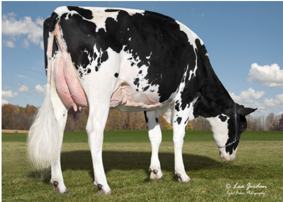
HEATHERSTONE JUST DO IT