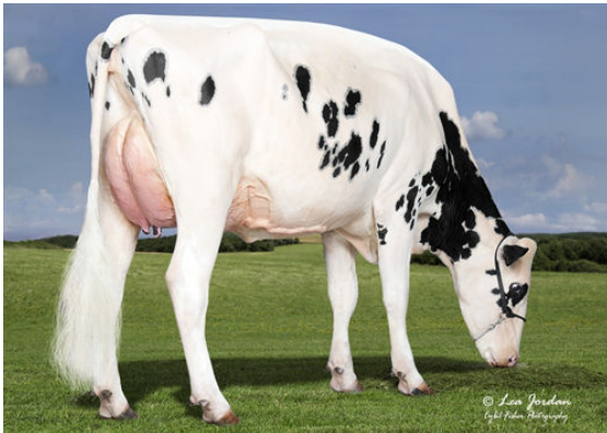
EVANS-H BYWAY JAMISEN