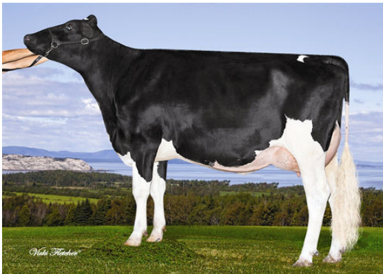
NORCA SILKY ALL RIGHT Dam