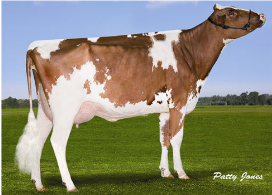
CHERRY CREST COLT BAMBI P