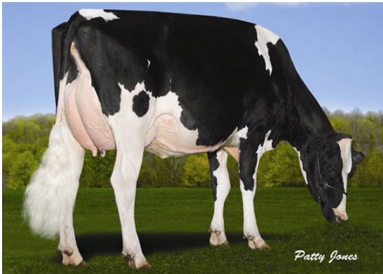
VELTHUIS SG MOM ALESIA Granddam