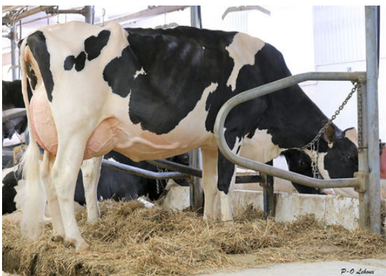
LEHOX DEALMAKER RALIE