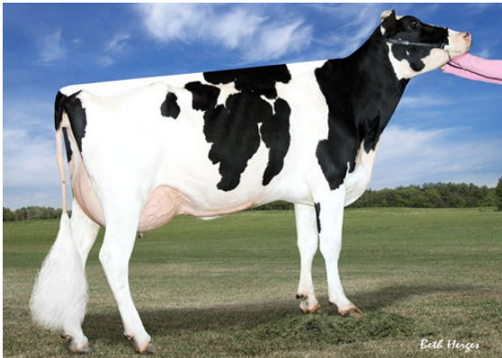
REGAN-ALH PLANET DELORIA DAM