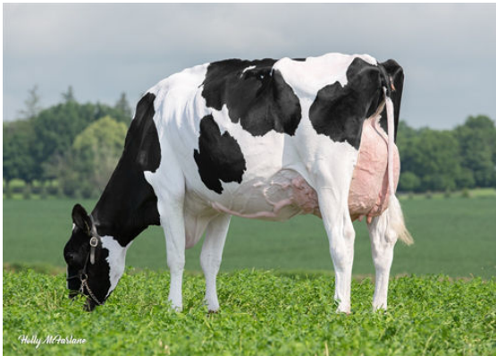
CLAYNOOK FINOLA EUGENIO DAUGHTER