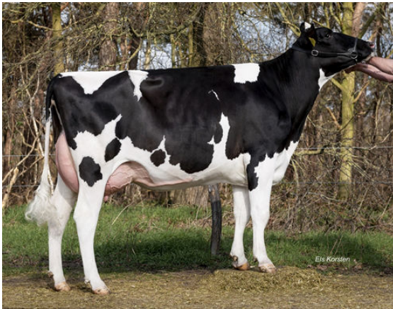
RETRAITEHOEVE MINA 240