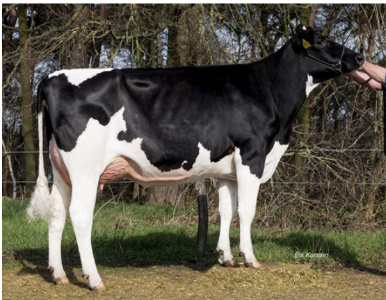
RETRAITEHOEVE LILYA 5