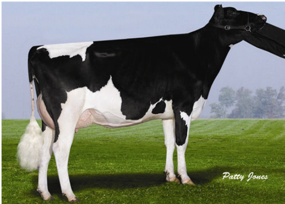
WHITTIER-FARMS HE REBECA FOURTH DAM