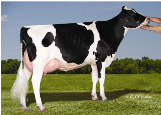
CHERRY CREST MANOMAN ROZ THIRD DAM