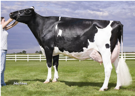
EARLY-AUTUMN GOLDEN RAE FOURTH DAM