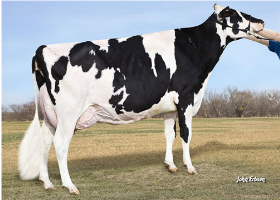
MORNINGVIEW BAXTER D-RAE THIRD DAM