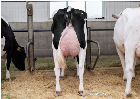
CLAYNOOK CLOVER GUARANTEE