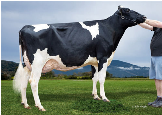
PEAK GUARANTEE NOBLE