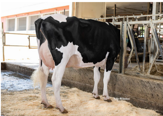
PROGENESIS GUARANT MILLIONS