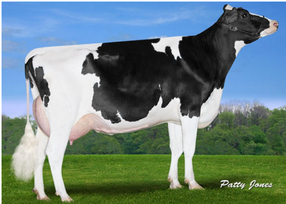
CLAYNOOK REATA WICKHAM DAM