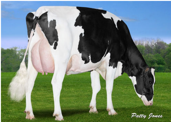
CLAYNOOK REATA WICKHAM DAM