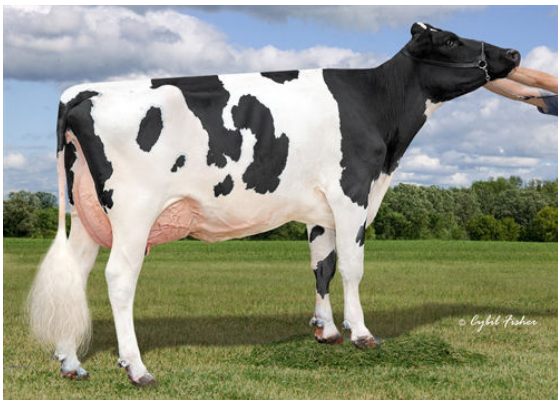
AOT HAWAI HOLLY DAUGHTER