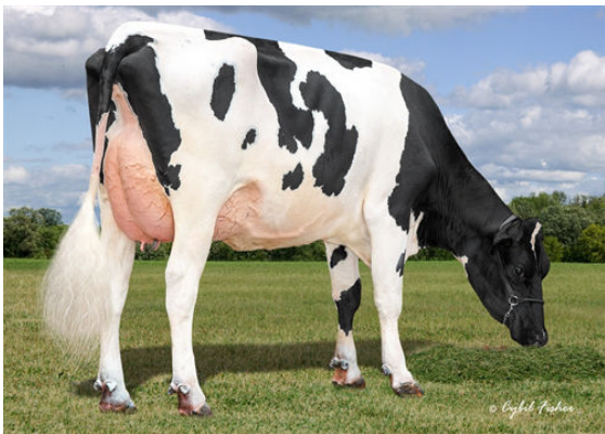
AOT HAWAI HOLLY DAUGHTER