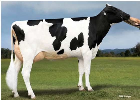
PROGENESIS JEDI HOLOCRON DAM