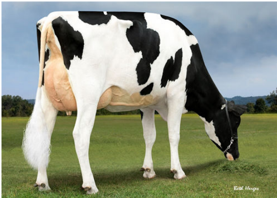
PROGENESIS JEDI HOLOCRON DAM