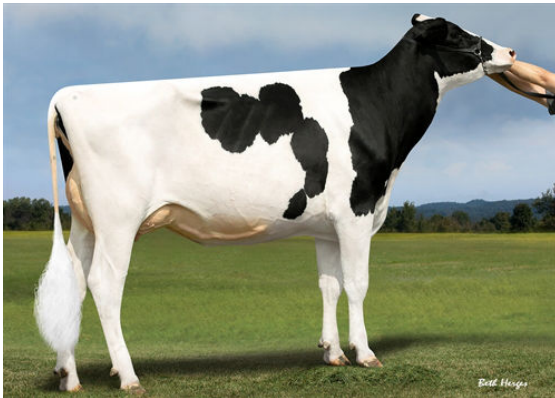
PROGENESIS JEDI HANSOLO DAM