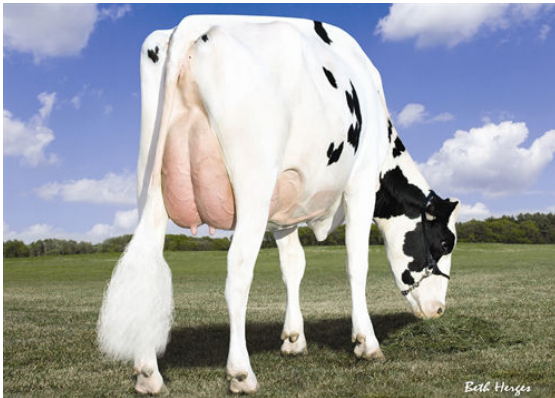
AMMON-PEACHEY SHANA FOURTH DAM