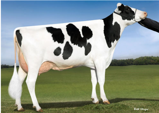
OCD SUPERSIRE 9882 GRANDDAM