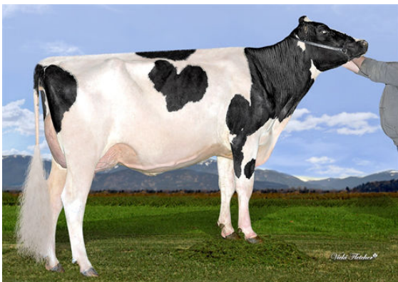
WESTCOAST POPSTR SIL6827 8977 DAUGHTER