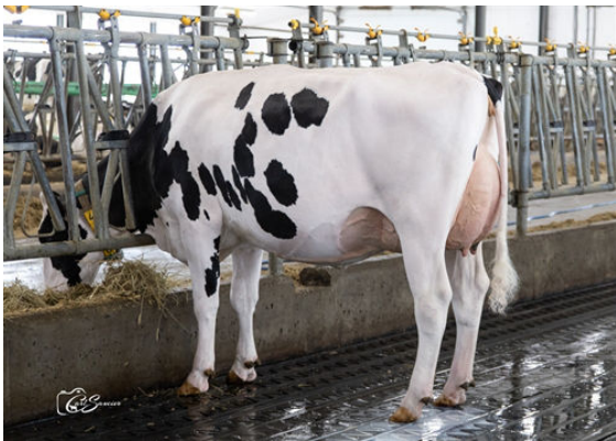
MARIDEL POPSTAR PALY DAUGHTER