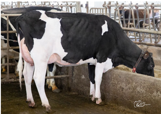
MALTEC ULIE DAUGHTER